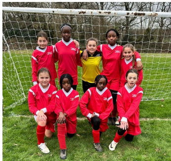
Quarter-final Cup Match

Well done to the Girls Football Team - we are extremely proud of all our players who represented our school to reach this exciting stage.